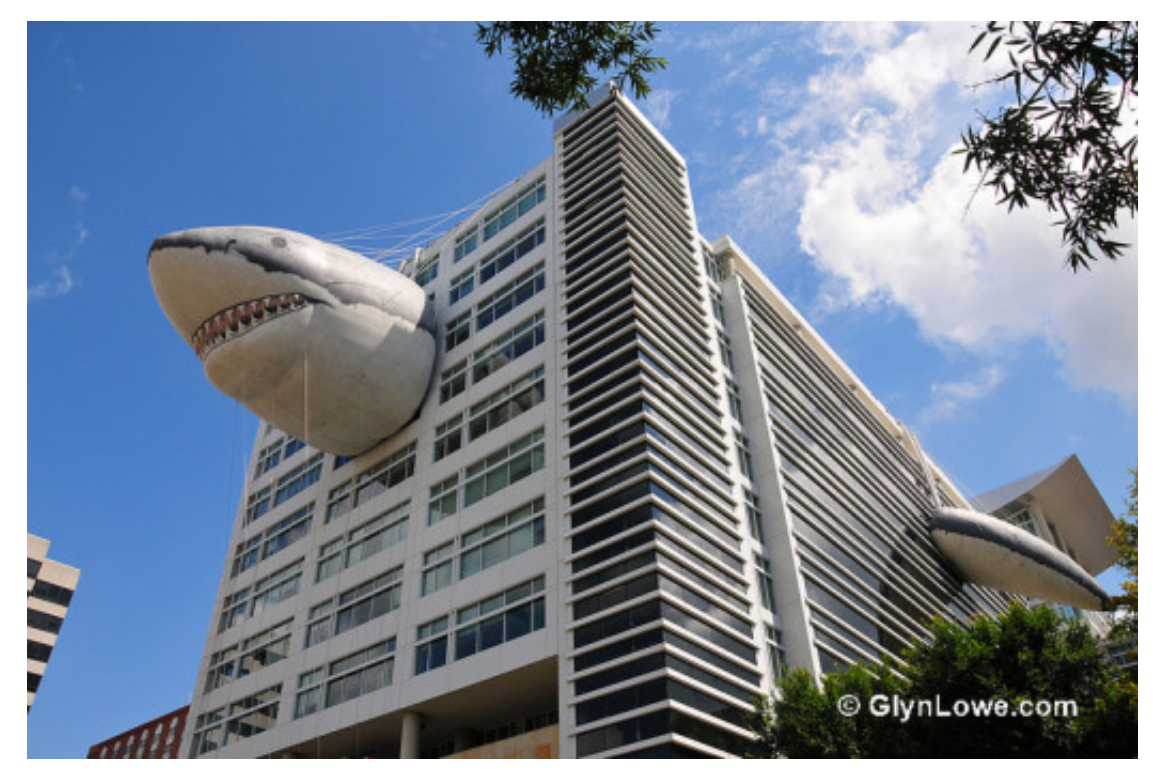
Shark Week. A massive inflatable Great White Shark in 5 pieces adorns the Discovery Channel HQ building in Silver Spring, Maryland.

Rather than spending $200 million subsidizing a giant mall, county and state officials collaborated to find a site for the new headquarters for the Discovery Communications Corp, which was then housed in several different locations around the Washington area.