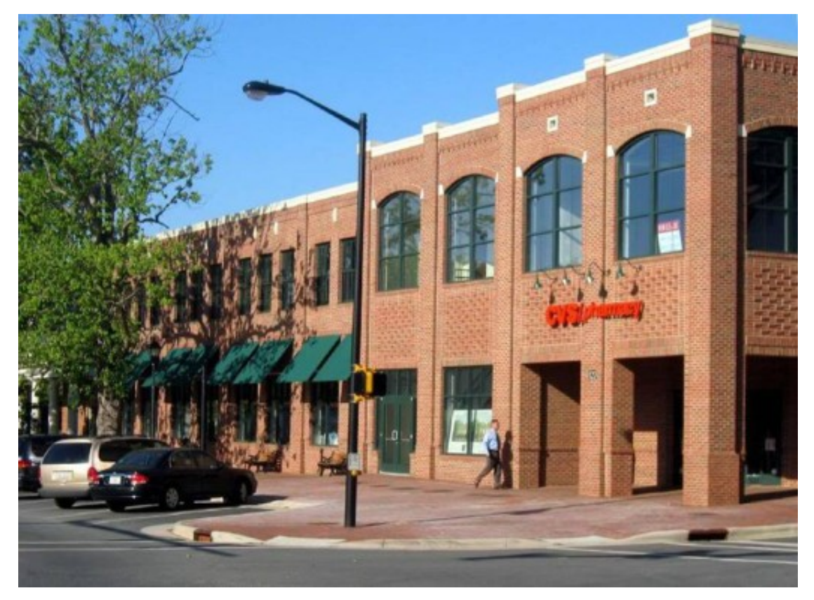
Davidson, North Carolina, did not settle for CVS' "Plan A" design.

because they recognized the economic value of being in a profitable location.