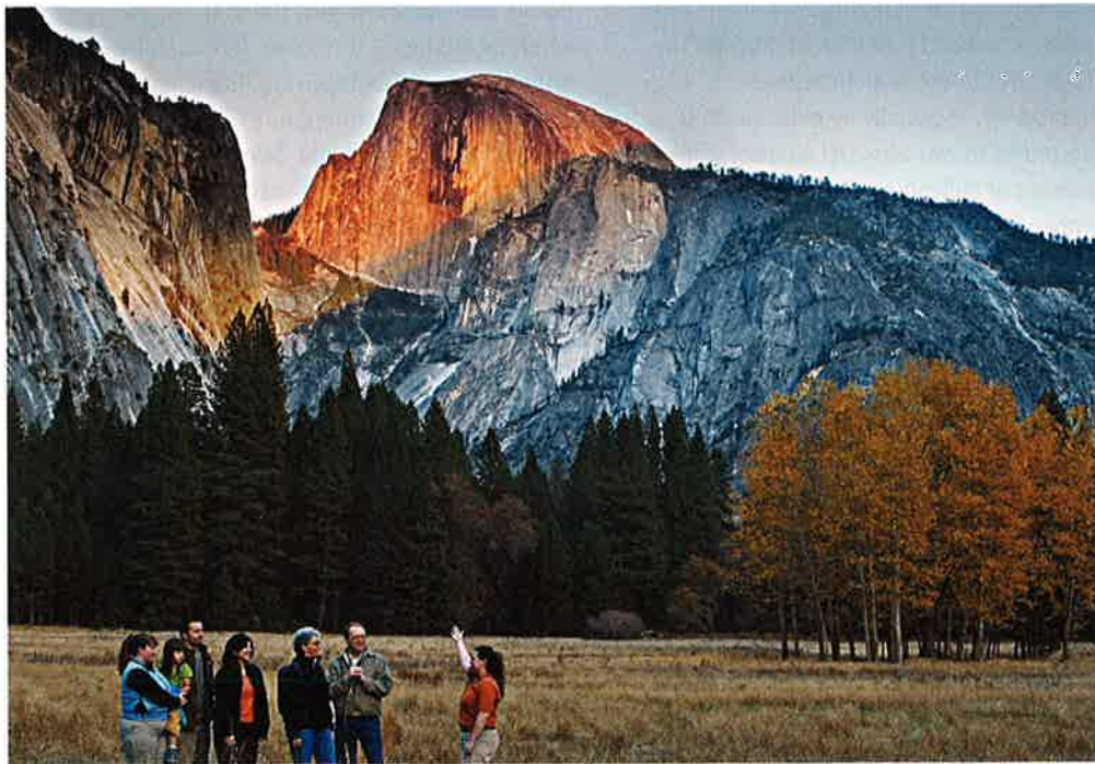
Half Dome rises above Yosemite Valley in Yosemite National Park, California.

If a destination becomes too crowded, too commercial, or too much like every other place, then why should tourists bother to go there?