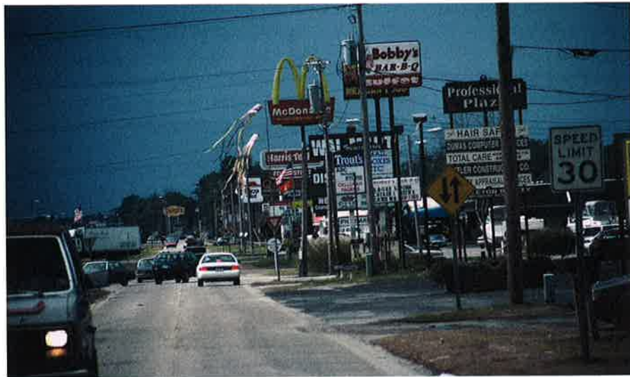
Sign clutter, common in many tourist-focused communities, is ugly, ineffective, and expensive.

Gettysburg, Pennsylvania, developed a communitywide interpretation program that involves public art, wayside exhibits, and interpretive markers that tell the story of the town and its role in the Civil War's Battle of Gettysburg. The city did this after it realized that most tourists were driving around the national military park and then leaving town without realizing that