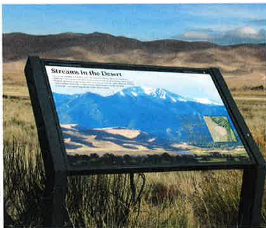
Interpretation results in better-managed resources.

Though there are many great destinations in America, very few noteworthy journeys remain. Except for a few special roads like the Blue Ridge Parkway or the Natchez Trace Parkway, a drive along a typical American highway can be a profoundly depressing experience. The late author and television commentator Charles Kuralt put it this way: "Thanks to the interstate highway system, it is now possible to drive across the country from coast to coast