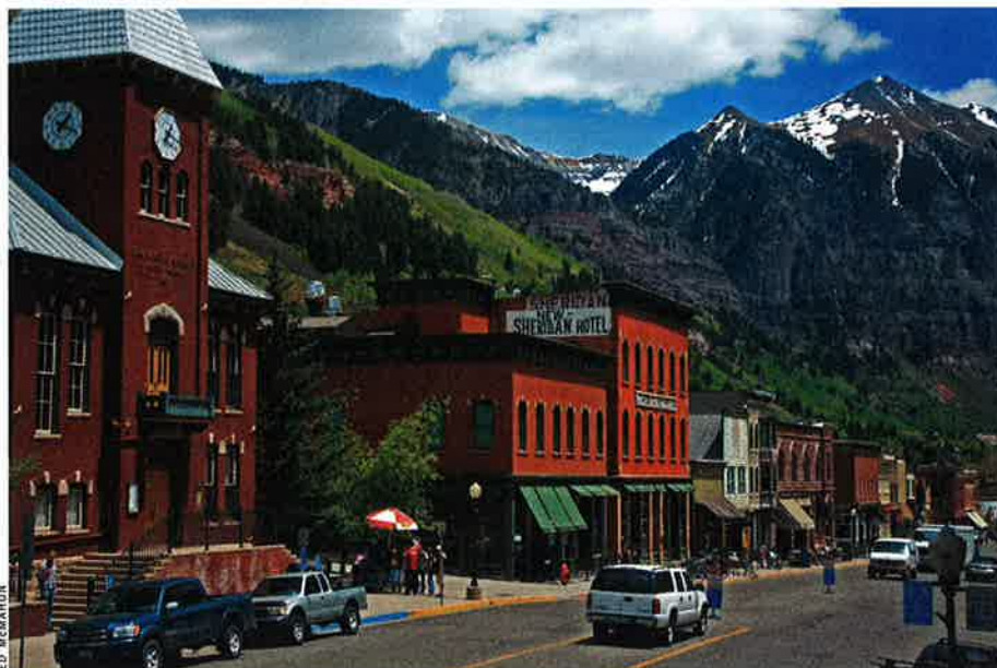
Promoting tourism means protecting authentic destinations, such as Telluride, Colorado.