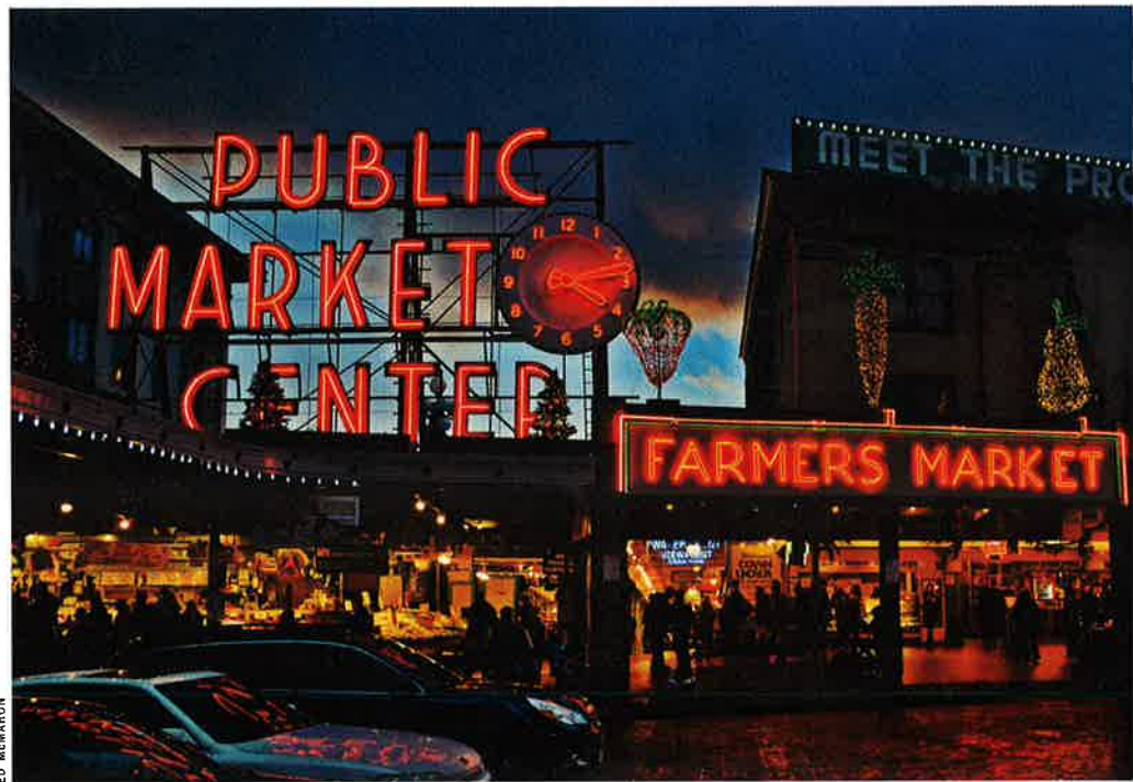
Pike Place Market in Seattle, Washington.

2. Focus on the authentic. Communities should make every effort to preserve the authentic aspects of local heritage and culture, including food, art, music, handicrafts, architecture, landscape, and traditions. Sustainable tourism emphasizes the real over the artificial. It recognizes that